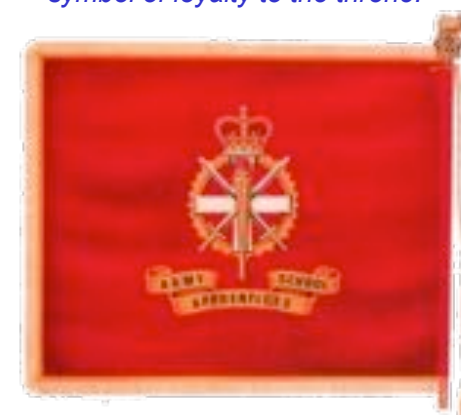
The reverse depicts the badge of the Army Apprentices School.