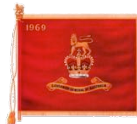
The obverse of the Banner depicts the Standard of the Governor-General of Australia and is a symbol of loyalty to the throne.