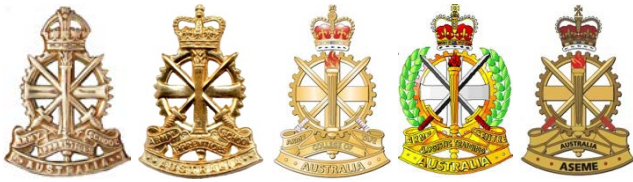
AAS 1951-54 AAS 1954-90 Army TAFE 1991-96 ALTC 1996-2017 ASEME 2017-on

The images below show the progression of the badge from the original (1951) "King's Crown" hat badge, through the "Queen's Crown" hat badge, and then the three School emblems, which were never actually struck as hat badges.