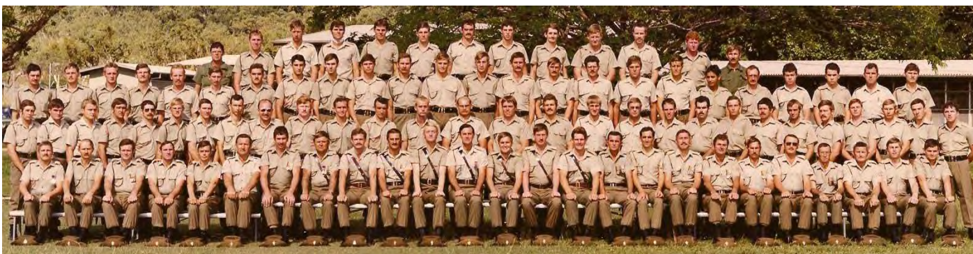
102 Fd Wksp (Lt) official photo of the unit following its raising in Jun 1981

He was promoted to LTCOL in Jan 1983, to become the Staff Officer - Aircraft Maintenance/Test Equipment, and returned to MEA for a further two and a half years.