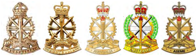
AAS 1951-54 AAS 1954-90 Army TAFE 1991-96 ALTC 1996-2017 ASEME 2017-on

The images below show the progression of the badge from the original (1951) "King's Crown" hat badge, through the "Queen's Crown" hat badge, and then the three School emblems, which were never actually struck as hat badges.