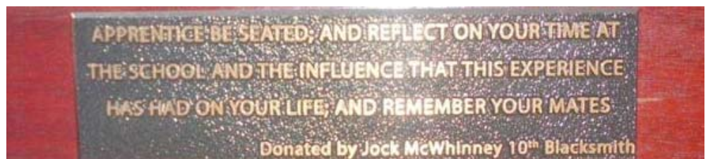
The Reflection Seat plaque

The Memorial Wall silhouettes the gates and holds the names of Apprentices who lost their lives whilst on active service.