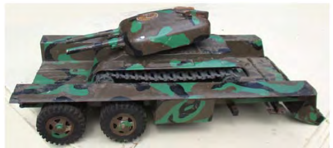
Before (above) and after (below)

Returning to the present, I have spent considerable time and money to restore the tank and transporter to near original condition of some 50 years ago. I have made some small modifications and additions that I believe improve the presentation. I removed the old battery container and wiring used for remote control of the tank as it is now a static display, and the wiring and container were awkward items. Additions I made are miniature 44-gallon fuel drums and ammunition boxes, placed in the cargo carrying section of the transporter, which was designed for this purpose.