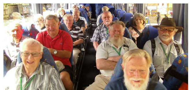
10 th Intake Reunion, Albury 21-22 October