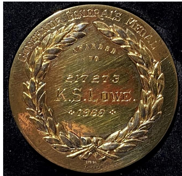
Reverse - Engraved

The medal was 47mm in diameter and was of gilt silver.