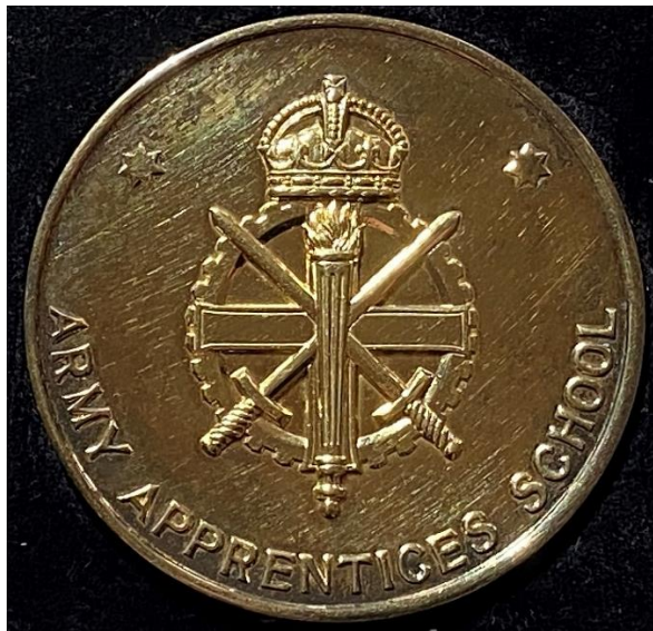
Obverse – AAS Badge