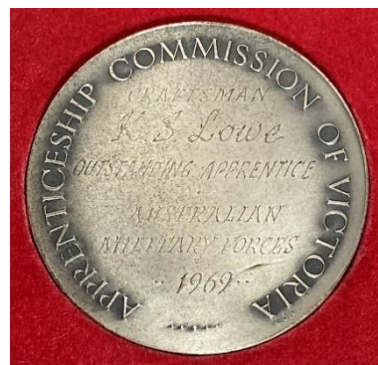
(57mm diameter silver Medallion)