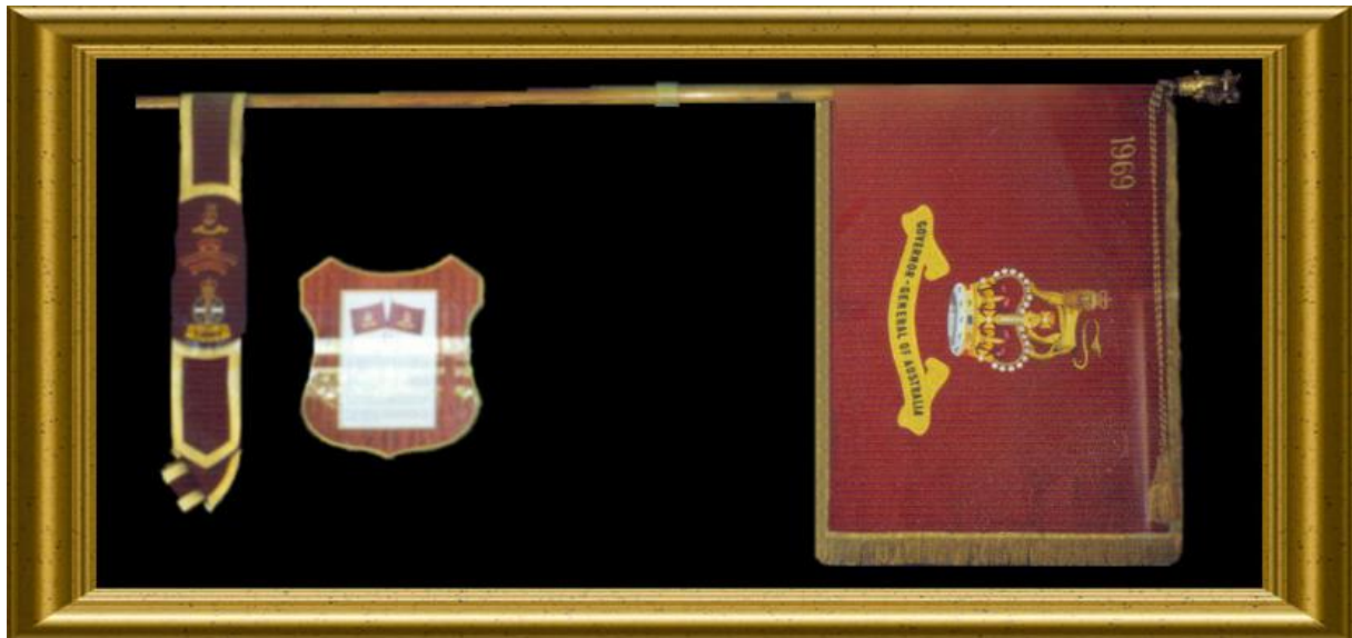
The Banner at rest in the Chapel of Saint Peter, Bonegilla, Victoria.