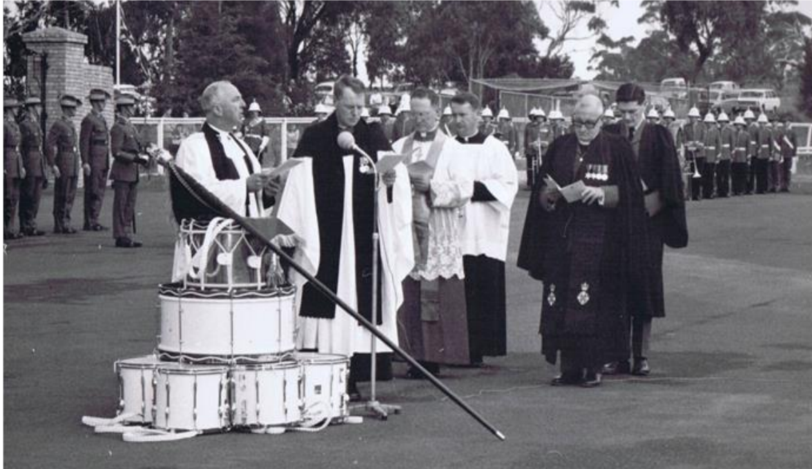
Blessing of the Banner by the Chaplains General with Southern Command Band in the background.

4 The parade originally planned for Citation Oval had, at short notice due to heavy rain during the days prior, to be relocated to the School parade ground inside the Marine Memorial Gates.