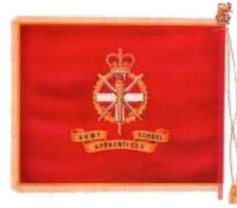
The reverse depicts the badge of the Army Apprentices School.