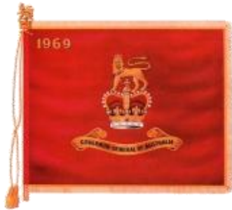
The obverse of the Banner depicts the Standard of the Governor-General of Australia, a symbol of loyalty to the throne, with the year of presentation.