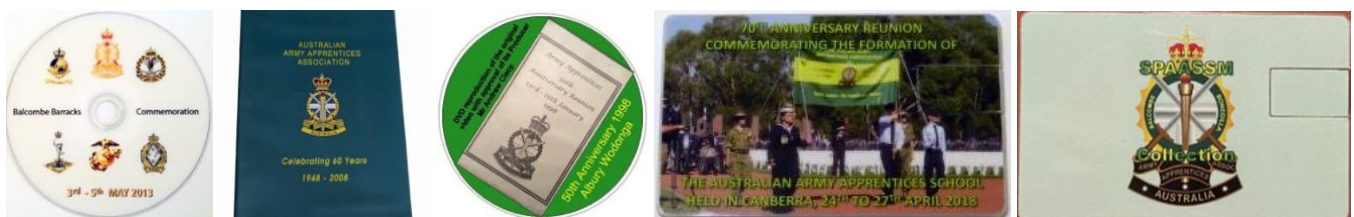
Balcombe Commemoration DVD, 60 th Anniversary DVD, 50 th Anniversary DVD, 70 th Reunion photo card, and SPAASSM Collection USB wafer