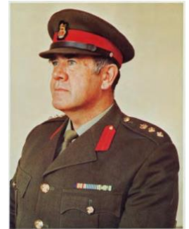
From the booklet The Official Opening of Latchford Barracks, Sun 25 Sep 1983 (SPAASSM PhII Binder 03, Item 01)